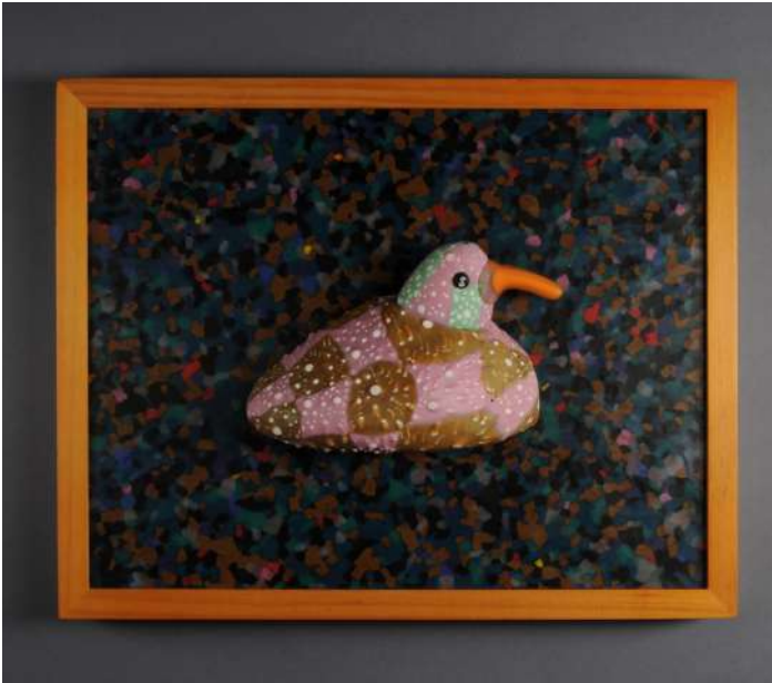
Amy's Camouflaged Pink and Brown Duck, 2013–2014