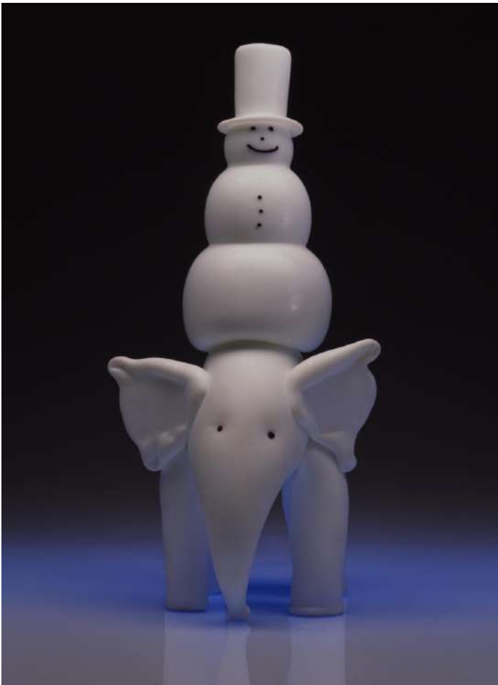
Frosty Elephant, 2003