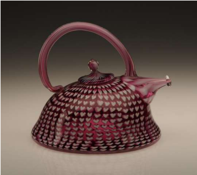
Ruby Heart Teapot, 1980