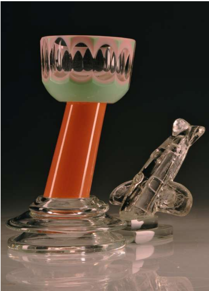
Bohemian Airplane Goblet from Fabricated Weird Series, 1980