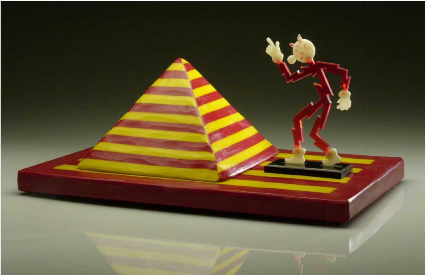
Reddy and Yellow Pyramid with Reddy Kilowatt, 2006