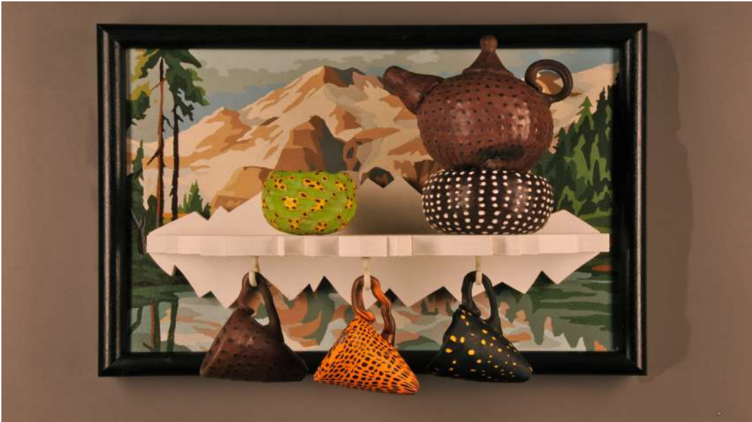
Granulare Tea Service, 1995