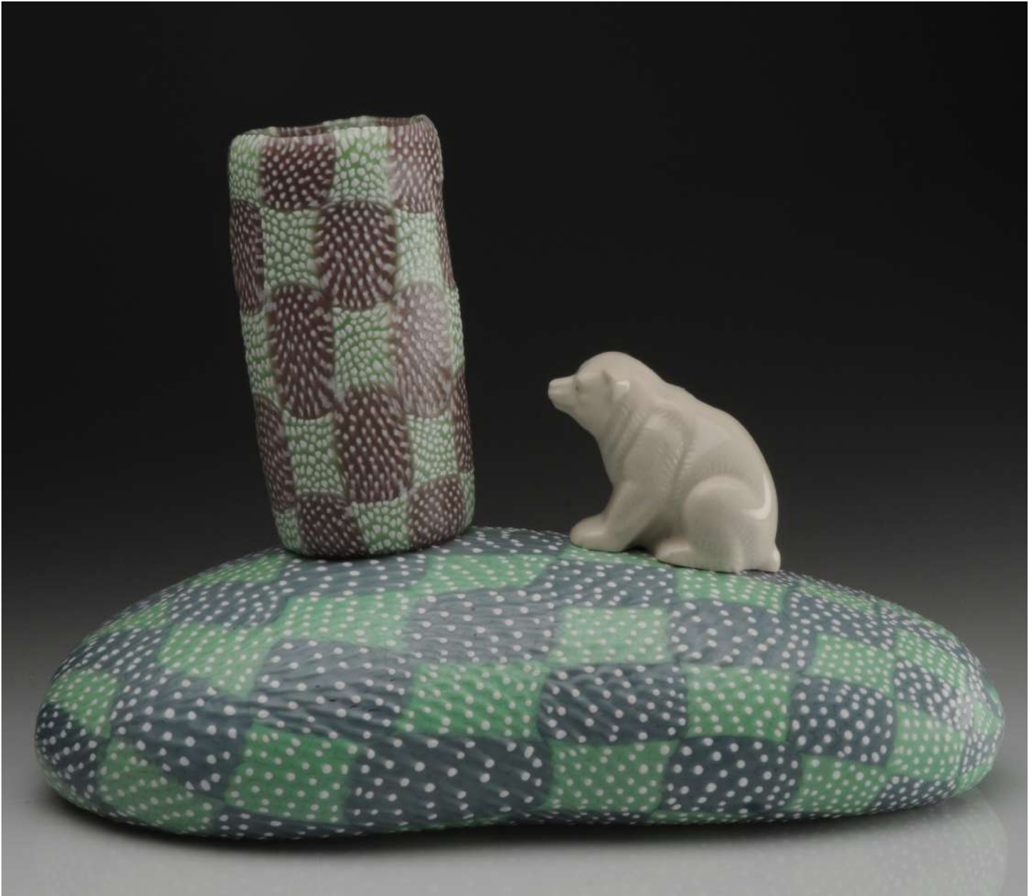
Pastel Polar Bear, 2013

MUSEUM OF GLASS TACOMA, WASHINGTON TRAVELING EXHIBITIONS MUSEUMOFGLASS.ORG/TRAVEL