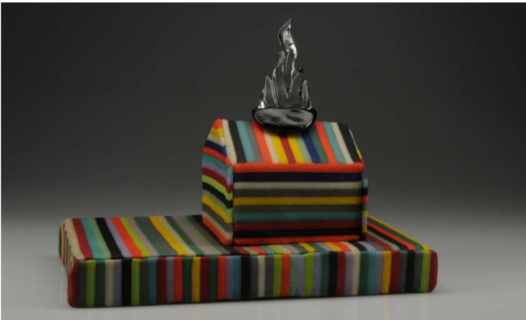
House on Raft, 2004, flames added in 2014