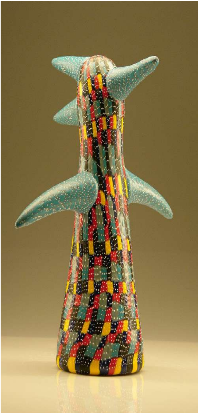
Granulare Bird , 2005