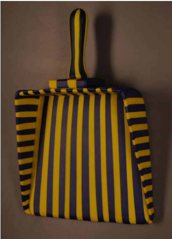
Dust Pan, 2011