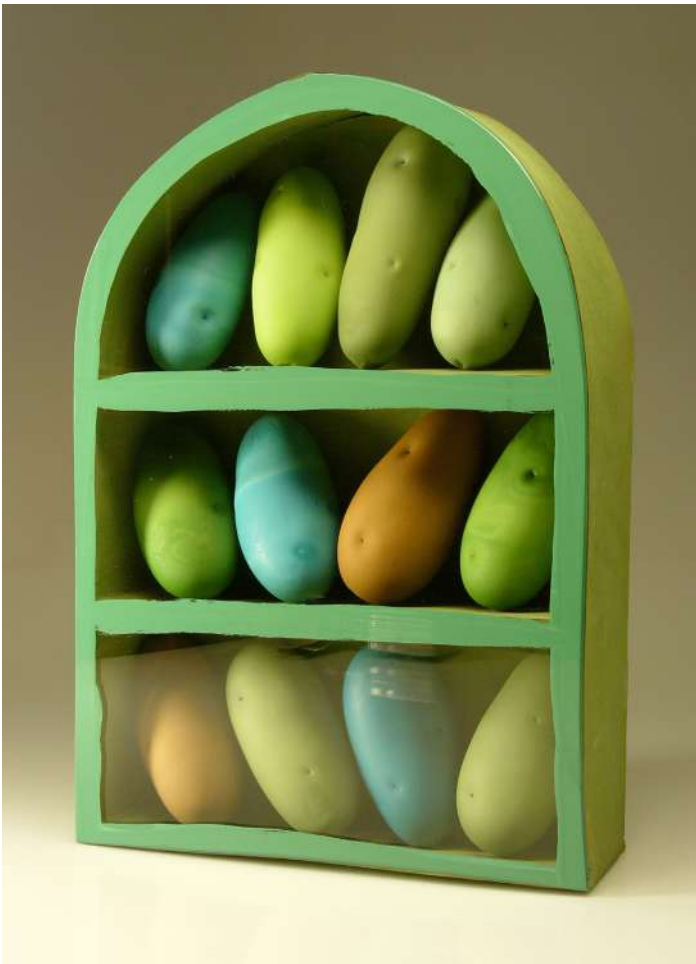
Potato Box, 2008