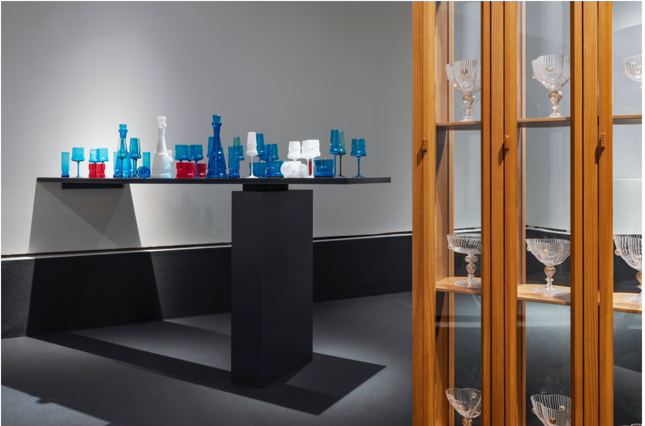
Exhibition view with Mosquito and Quadrifoglio, Ph. Enrico Fiorese